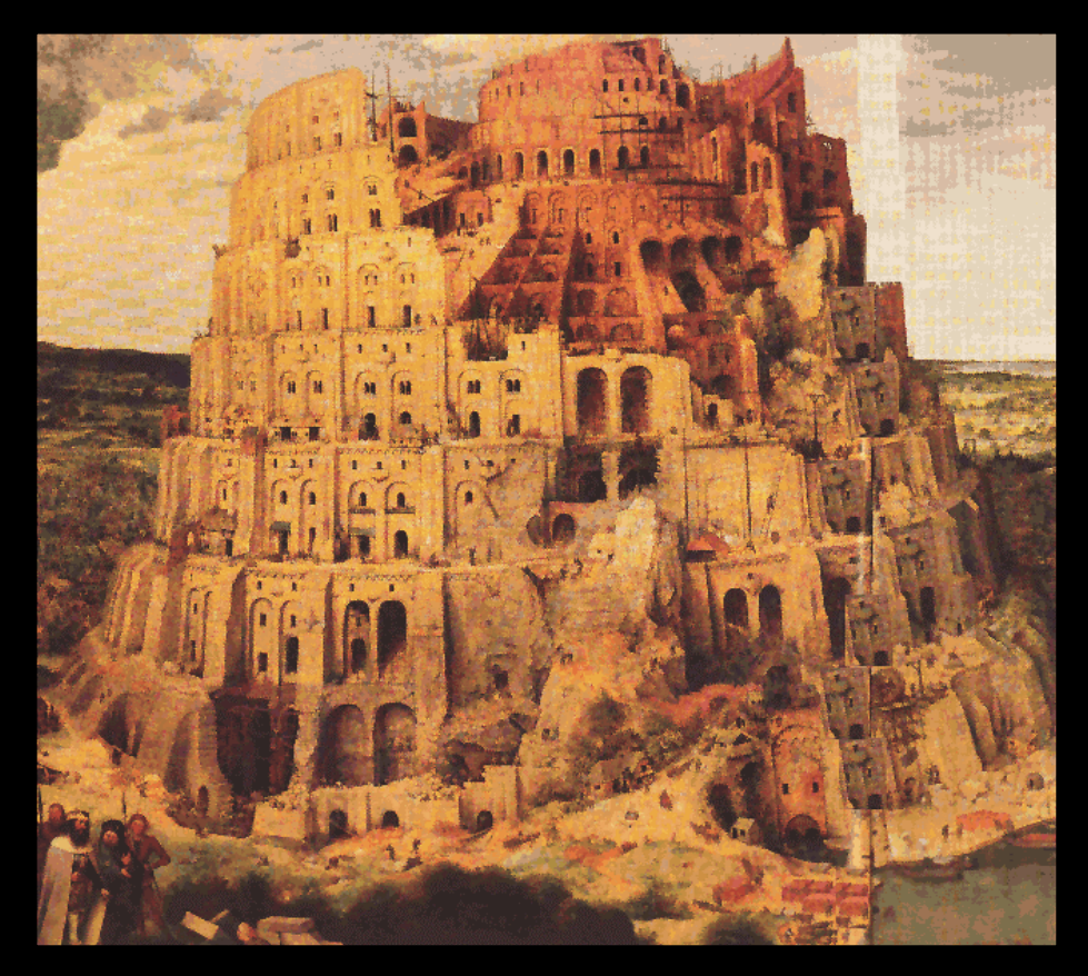
Tower of Babel, Bruegel, 1563