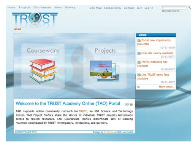
Figure 1: The TAO Portal Front Page

During this reporting period, we continued our effort in the development of "visual storytelling" as the vehicle for this communication. In project profiles, lightweight multimedia shorts are used to