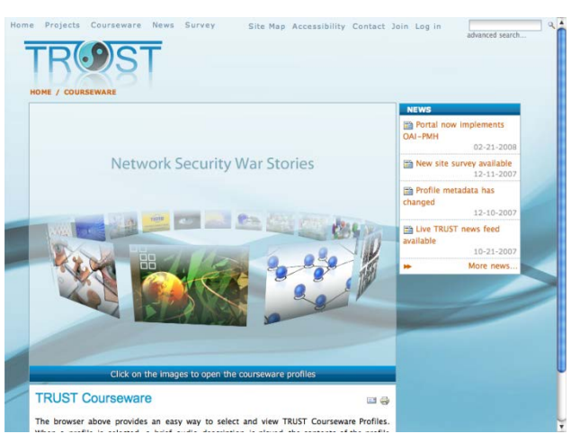
Figure 2: The Visual Browser for TAO Courseware Profiles

Accompanying this extension in audience, we enhanced the user experience on TAO. A keystone element in our strategy was the introduction of "visual browsers" as an alternative way of presenting and selecting profiles from collections. This navigation vehicle was influenced by innovations such as Apple's "cover flow" browsers and its distinct quality makes a significant contribution to the visual impact of the portal. At the same time, we have retained the tabular, text-based browser of the courseware profiles as a navigation alternative. These changes resulted in significant increases in TAO portal usage and in the number of learning modules and courseware available.